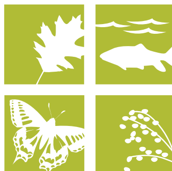
NON-ACADEMIC CAREERS PANEL

Organized by the Ecology Graduate Student Organization